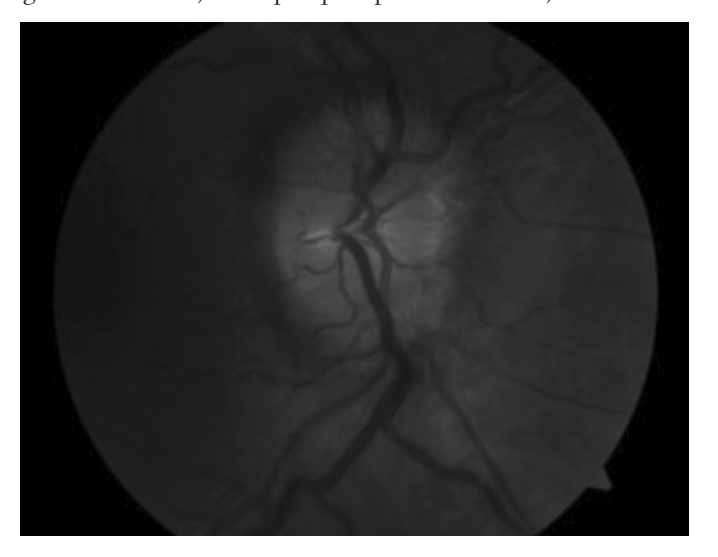
Figure 1. Fundoscopic view of the left disc revealed papilledema

Treatment with body weight-adjusted low-molecular-weight heparin (2) initially and followed later by warfarin resulted in partial recovery of vision and relief of headache. Currently, the patient is on our regular follow-up, and he has been advised against alcohol intake. Later an extensive search for any underlying hypercoagulable state (3) was performed including protein C and S level, anti-thrombin three levels, factor 5 Leiden and prothrombin gene mutations, anti-phospholipids antibodies, anti-nuclear